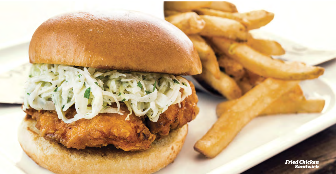
Fried Chicken Sandwich