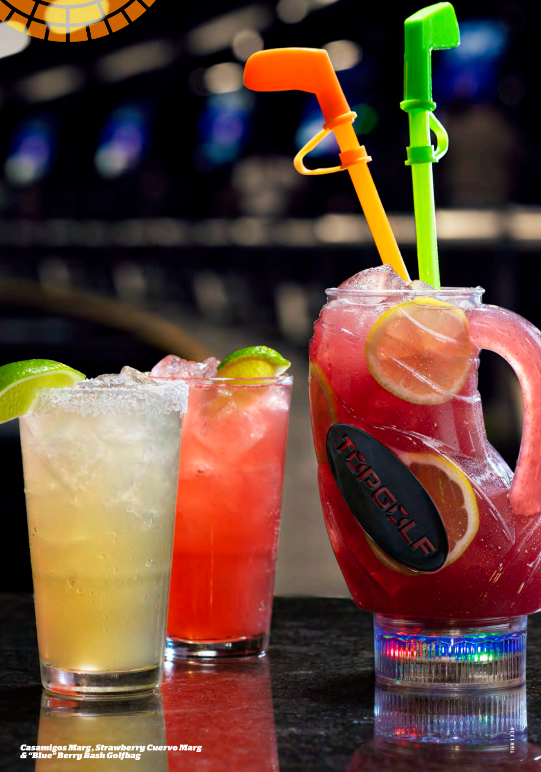
Casamigos Marg, Strawberry Cuervo Marg & "Blue" Berry Bash Golfbag

ADD A FLOAT OF GRAND MARNIER 2 (150 CAL.)