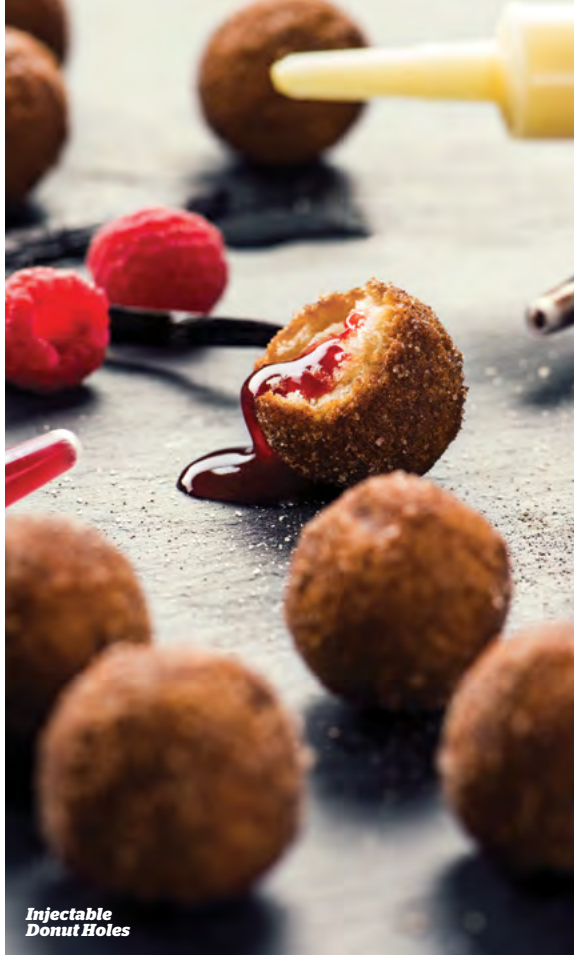
Injectable Donut Holes