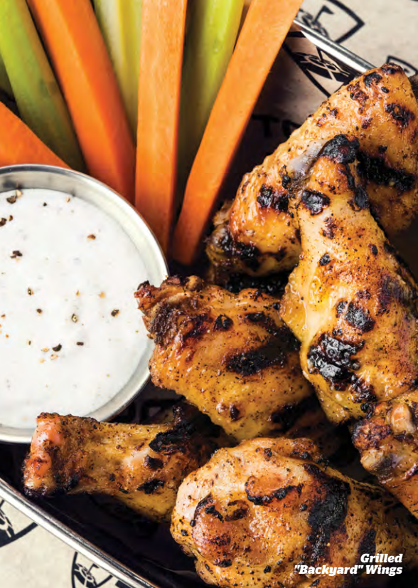
Grilled "Backyard" Wings