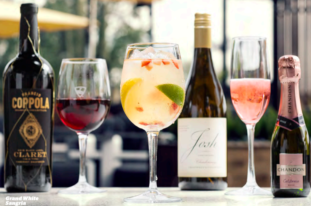
Grand White Sangria