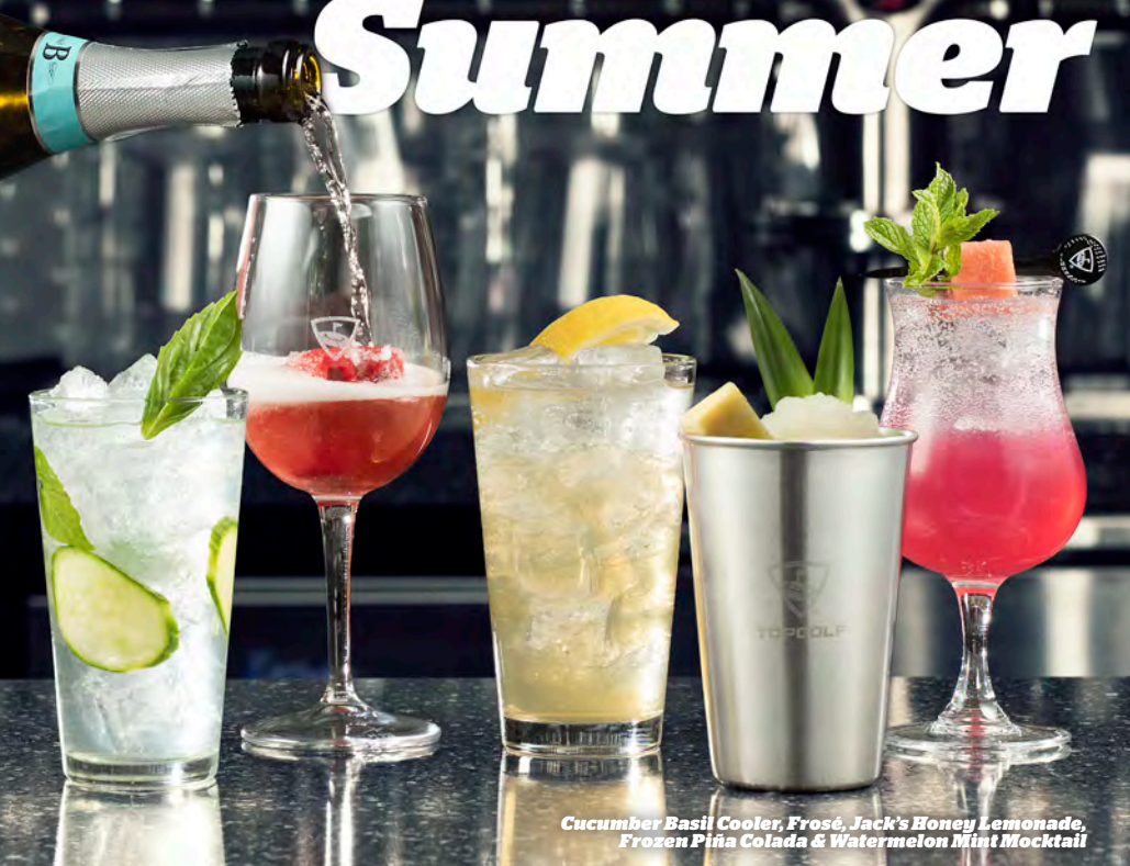
Cucumber Basil Cooler, Rosé, Jack's Honey Lemonade, Frozen Piña Colada & Watermelon Mint Mocktail