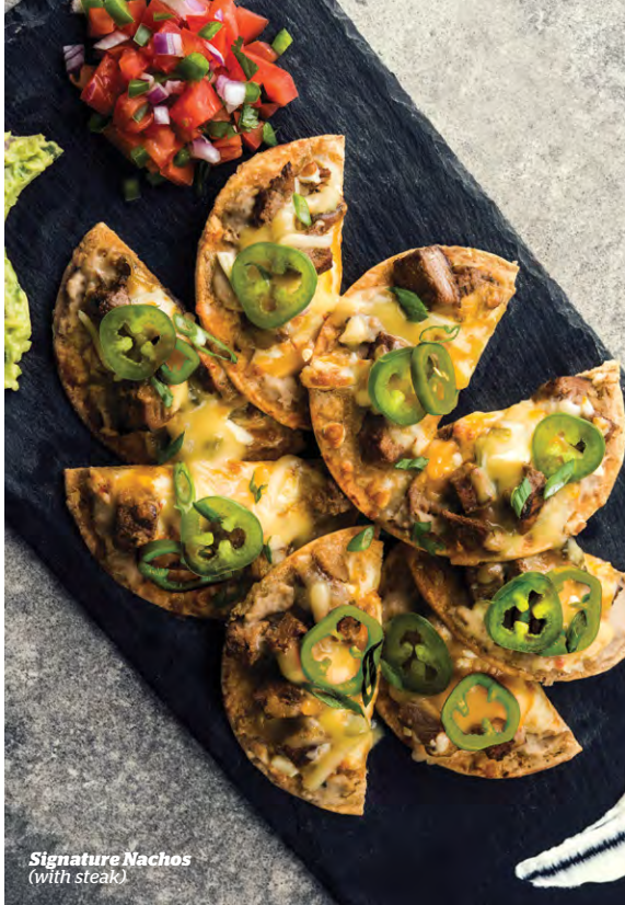
Signature Nachos (with steak)