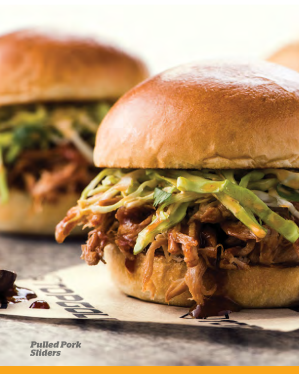
Pulled Pork Sliders