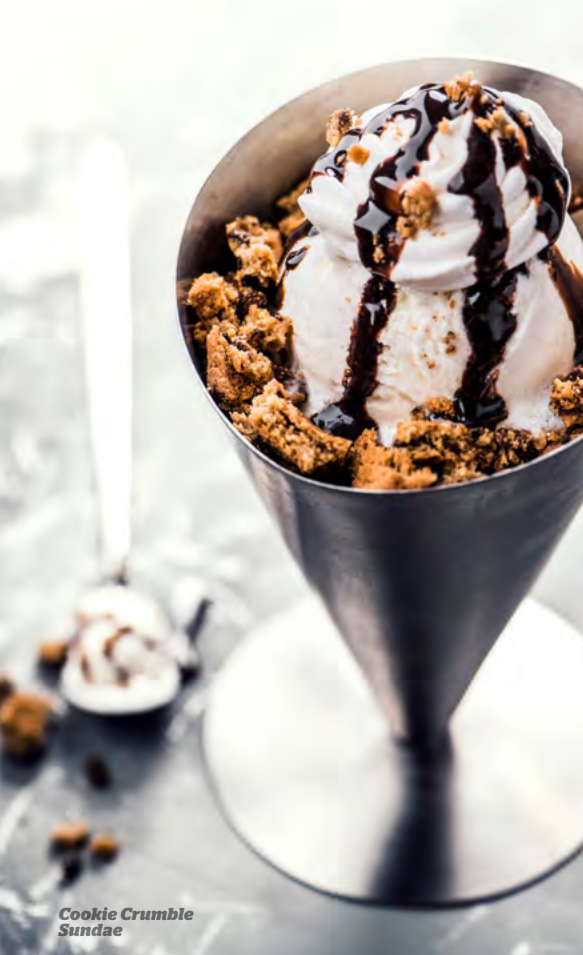
Cookie Crumble Sundae