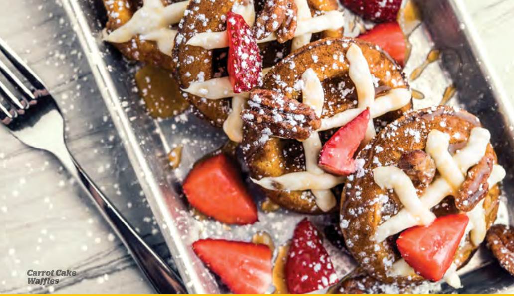
Carrot Cake Waffles