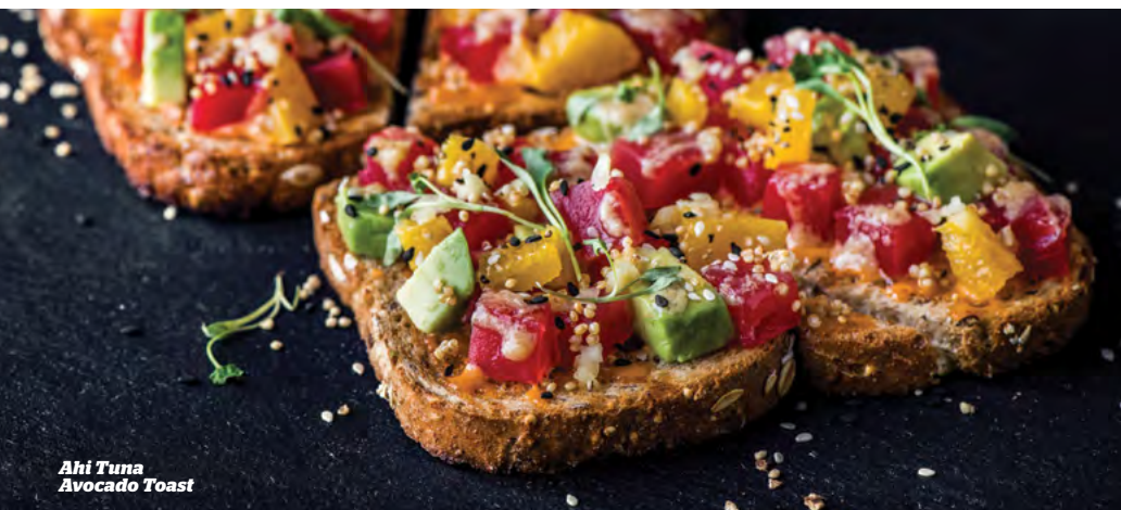
Ahi Tuna Avocado Toast

Seeded bread + miso dressing + crispy quinoa + diced orange + cilantro + sesame seeds 990 CAL.